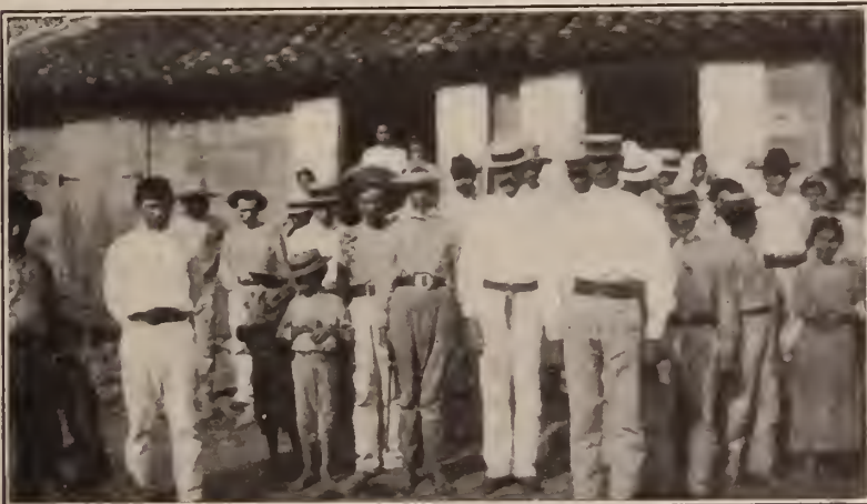
AND THE CONGREGATION

Nine years ago the writer and one of the missionaries held a service in a thickly settled country district where no Protestant service had ever before been held. The missionary preached out of an old Spanish Bible, an heirloom in the family of the man on whose grounds the audience was assembled; the heirloom, however, had no one to interpret its message. The been silent all these years, there being